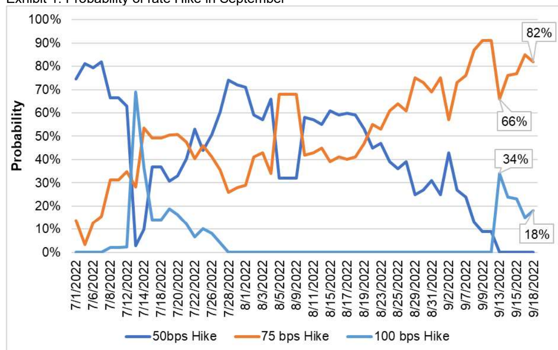
Exhibit 1: Probability of rate Hike in September